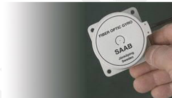
Fiber Optic Gyro (FOG).

A Fiber Optic Gyro is based on the Sagnac effect. The time for light to travel in a coil is dependent of the rotation of the coil. In a ring fiber optic gyro light is divided into two beams entering a fiber coil in opposite directions. After exiting the coil the two beams are combined in a coupler and a phase difference proportional to the rate of rotation is measured